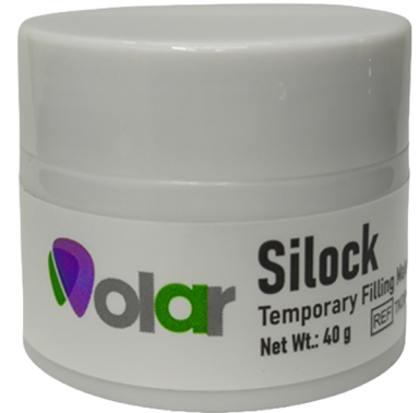
1 Plastic jar 40 grams Silock paste