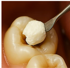
Easily remove silock in one portion